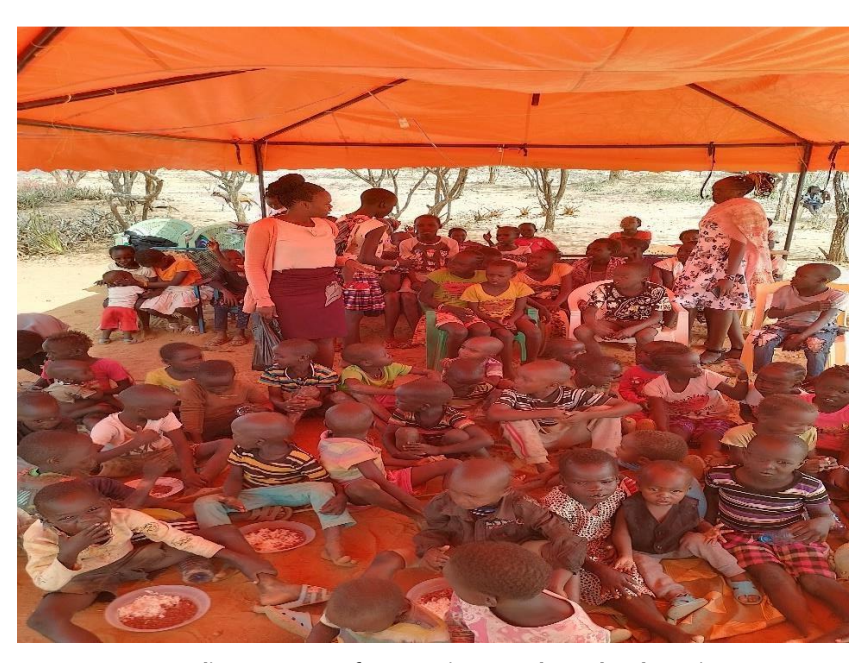
Feeding program for ongoing Sunday school seminar