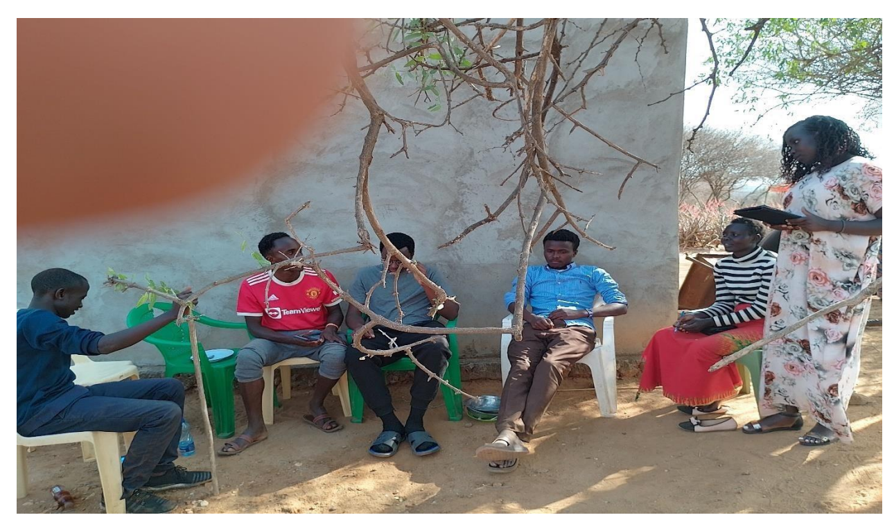
Members group discussion