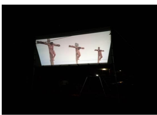
Showcasing Jesus film in Pokot language as a tool of evangelism and discipleship