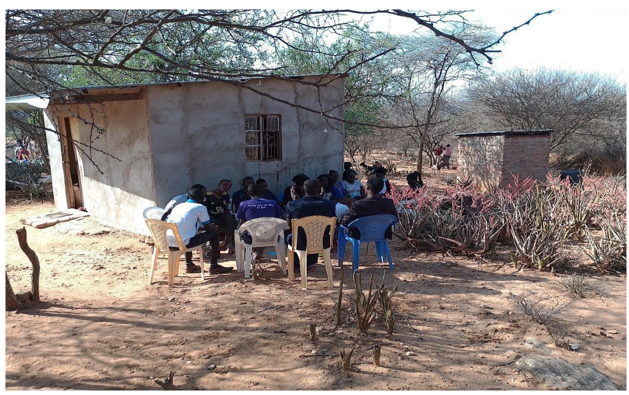
Members group discussions