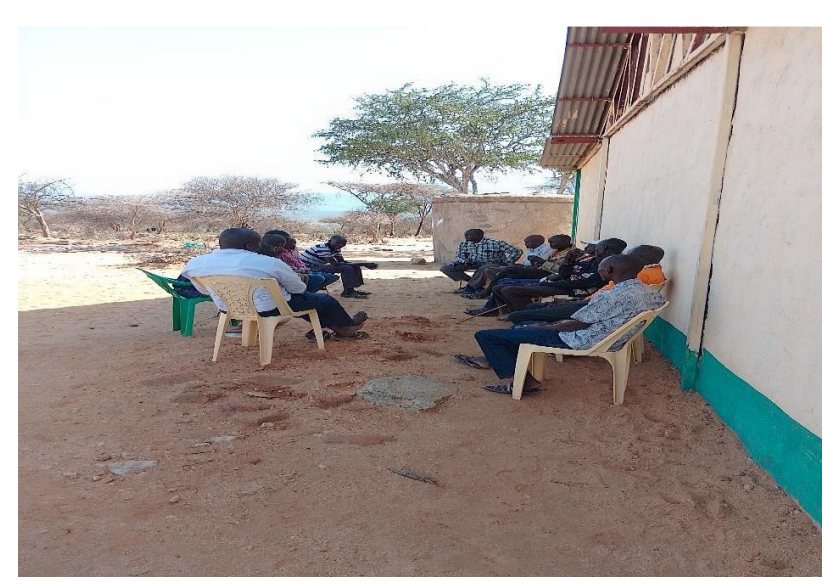
Men seminar at the main station

On Tuesday, we split up our team to various places which includes Tuwit, Kariamawoi (8km journey from the main station), Katumen and Tipet which is across the river. This was a stretching time for everyone! It was challenging but rewarding for all of us. It was a new experience for new missioners, to take ownership of ministry, but for which I am very proud of them because they stepped up! It was a very emotionally stretching time for us and our team as we met with the people and communities. We learned about heartbreaking challenging situations in family dynamics, drug abuse among the youths, early marriages, school dropouts, the tiny statistics of splinter groups among the churches, lack of food and clothing among the young children, sickness and about severely of spiritual darkness. Nonetheless, we were also invigorated and inspired about all the ministry opportunities in front of us that we can partner with AGC Kang'oletiang and ACCK Kiwawa on together in the future.