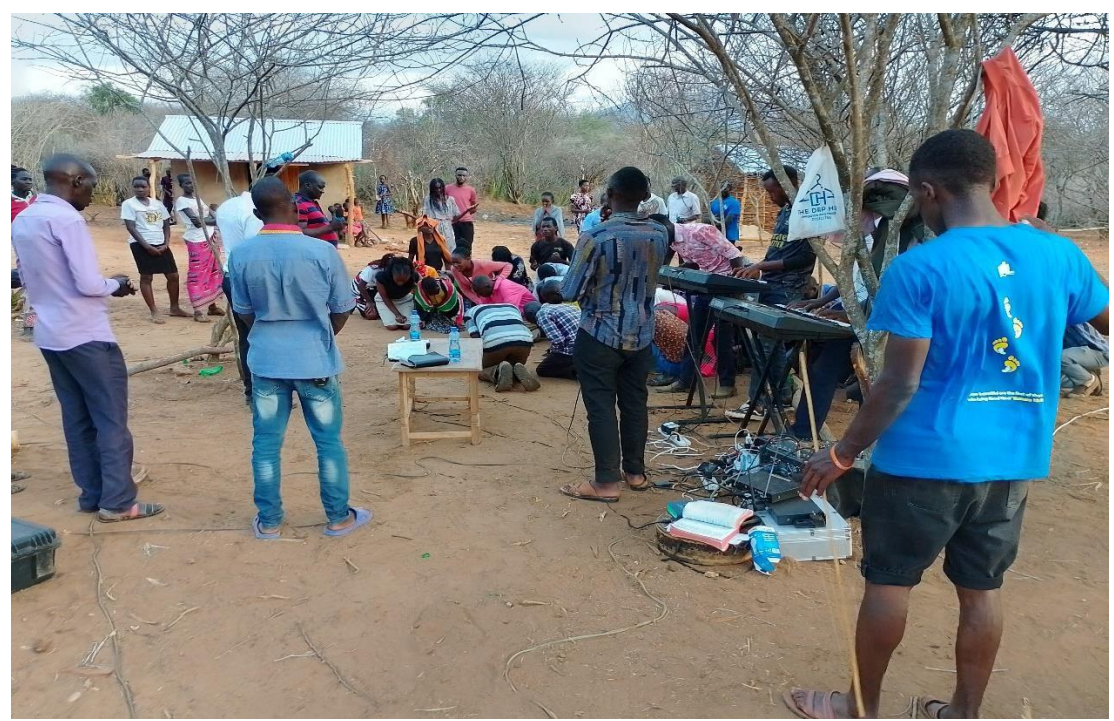
Kariamawoi open air crusade