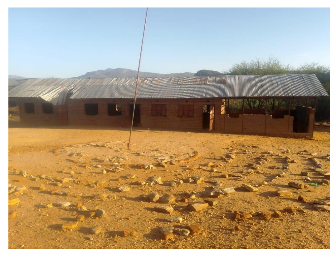
Kong'aletiang primary school

also extend as protection interventions to address the rights of young girls and prevent early pregnancies.