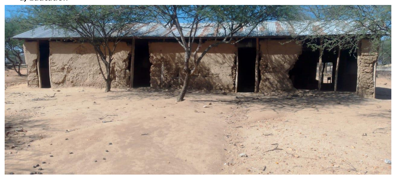
Kong'aletiang primary school