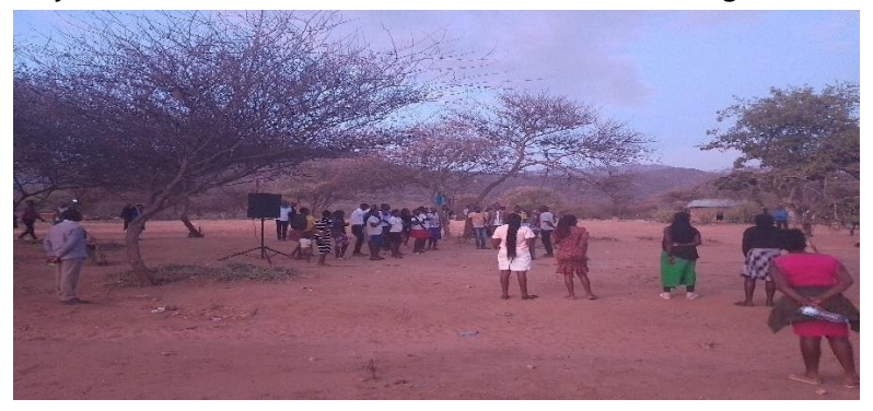
Katumen open air crusade

As we travel across West Pokot County especially the Northern part in this year's annual mission, we interacted with different people, different communities that have different needs that we as Christian believers cannot assume. The need for basic healthcare, education, food, water and clothing and many others was widely witnessed that we would like to reminiscence together.